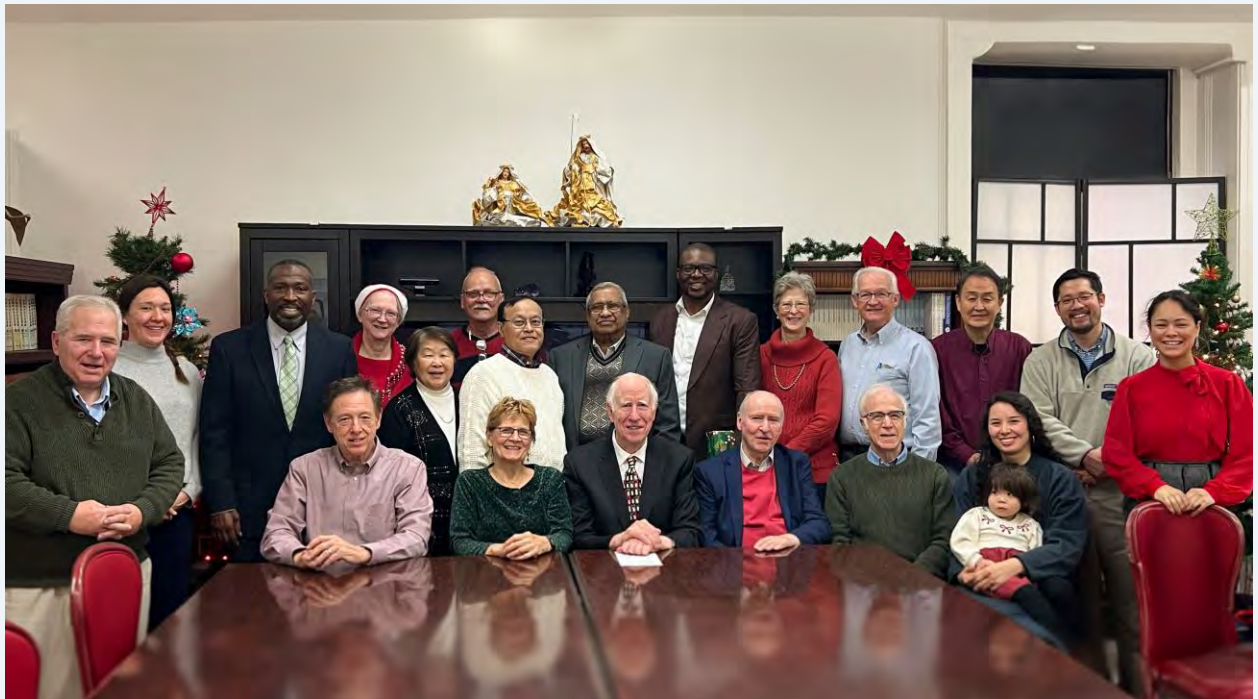
HJI Staff and Faculty Holiday Luncheon

This year marks the historic 50th Anniversary of HJI's founding. As we begin this new year, 2025, we offer our deepest gratitude and appreciation to our Founders, Rev. Sun Myung Moon and Dr. Hak Ja Han Moon, and to the Family Federation for World Peace and Unification. We also extend our very warmest and best wishes to our students, alumni, colleagues and friends in hopes of a most productive, healthy, and rewarding 2025.