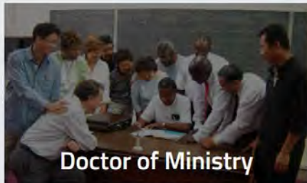
Doctor of Ministry