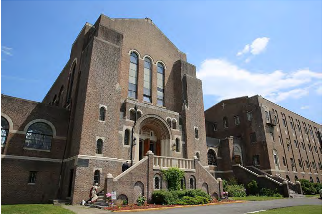
Unification Theological Seminary in Barrytown, NY

Forty-six years ago today, on September 20, 1975, the Unification Theological Seminary ( UTS ) opened its doors in Barrytown, New York, to the first class of 56 students, who enrolled in a two-year religious education program.