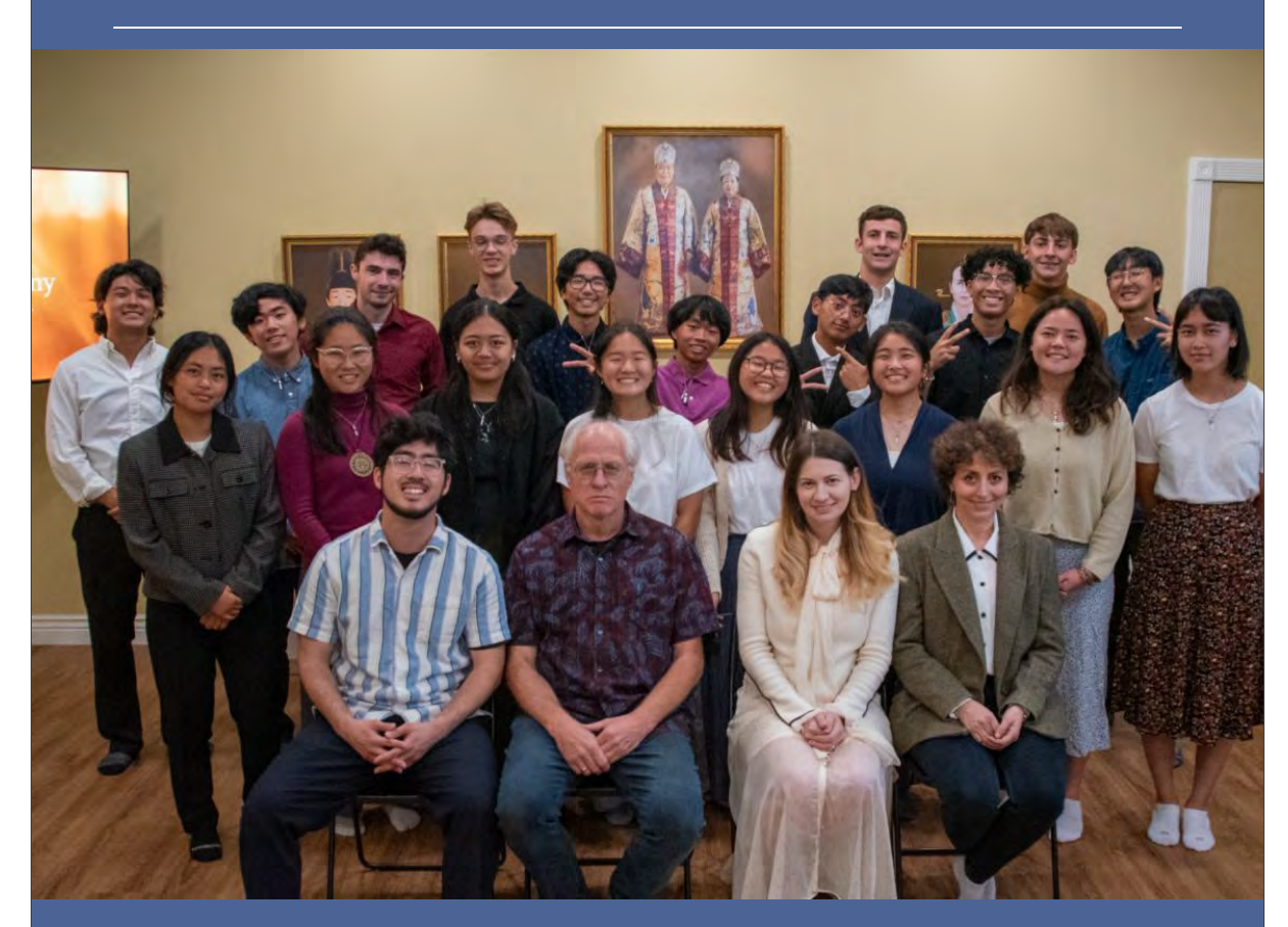
Pictured above: Cheon Il Guk missionaries and staff in the Bay Area Family Church Cheon Shim Won after their pledge ceremony