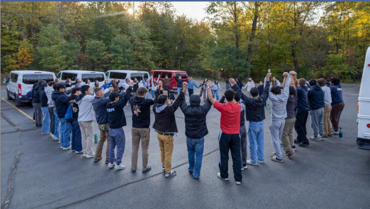
Pictured above: Send off for 1st years and Captains before they go into 2nd condition