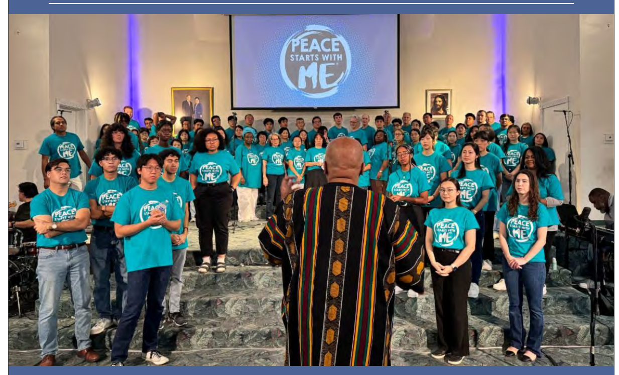
Pictured above: A glimpse of the Peace Starts with Me Music Masterclass that happened in L.A. October 25-26