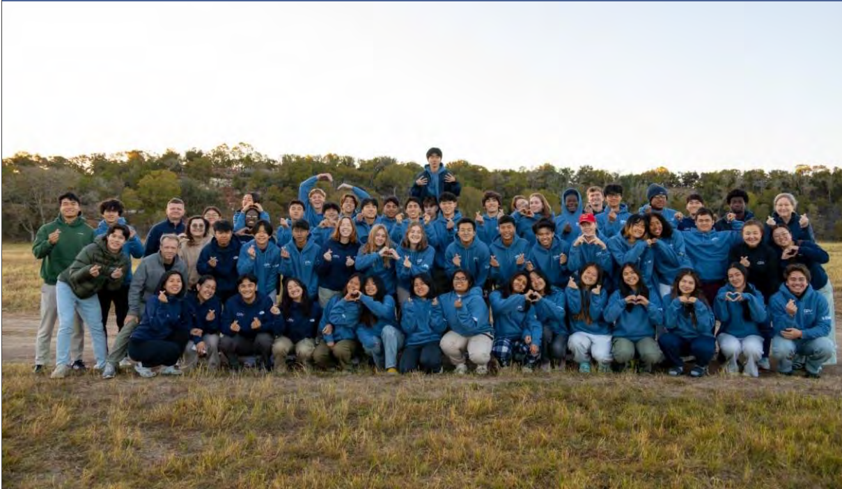
Pictured above: First years and Captains in their new GPA apparel at Morgan's Ranch

Strong bond of heart is the force bringing the world into life