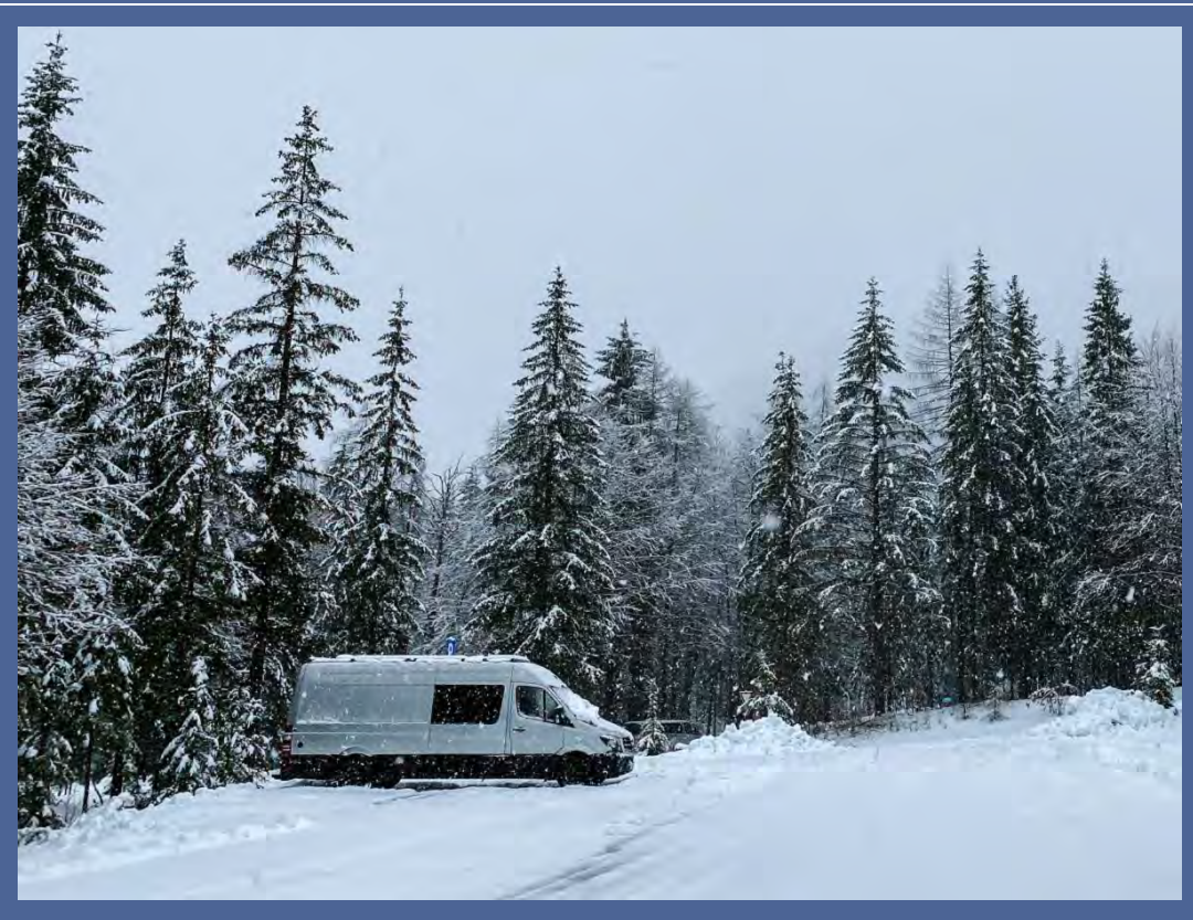
Pictured above: An image from Google. But it'd be nice if there was some snow now, right?