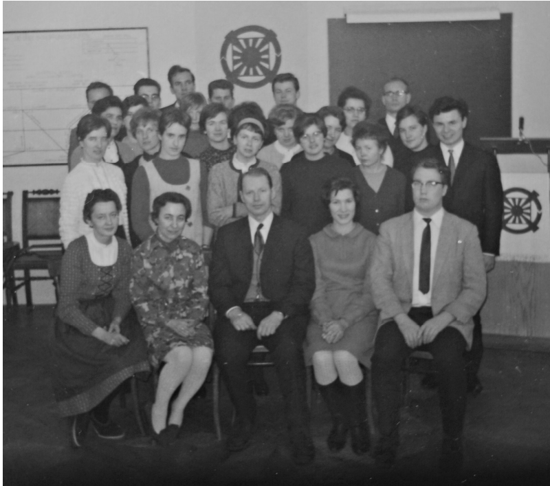
Figure 3: Group picture of Austrian members and guests in Schlüsselgasse, January 1969