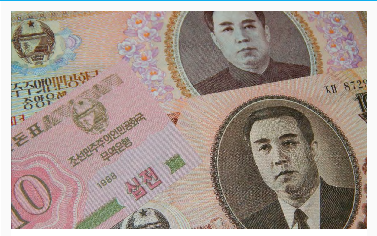
The Future of North Korea's Economy: Sustain, Collapse, or Transition Tuesday, January 17, 2 – 3 PM EST (New York Time)

The International Association for Peace and Economic Development