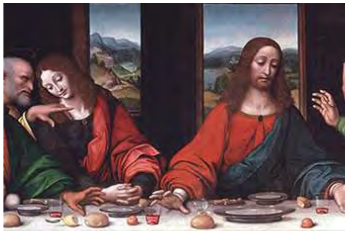
The Last Supper by Giampietrino, ca. 1520. Many debate whether Mary Magdalene is the effeminate figure (left) sitting next to Jesus (right) in this painting inspired by Leonardo da Vinci's The Last Supper .

and wife, but Lucifer slept with Eve and stole her from Adam. To restore the Fall, this action had to be reversed: an Archangel-type husband would have to give up his wife, representing Eve, to a man in the position of Adam — and do it voluntarily. Thus Pharaoh (the Archangel) was induced to give up Sarah (Eve) to Abraham (Adam).