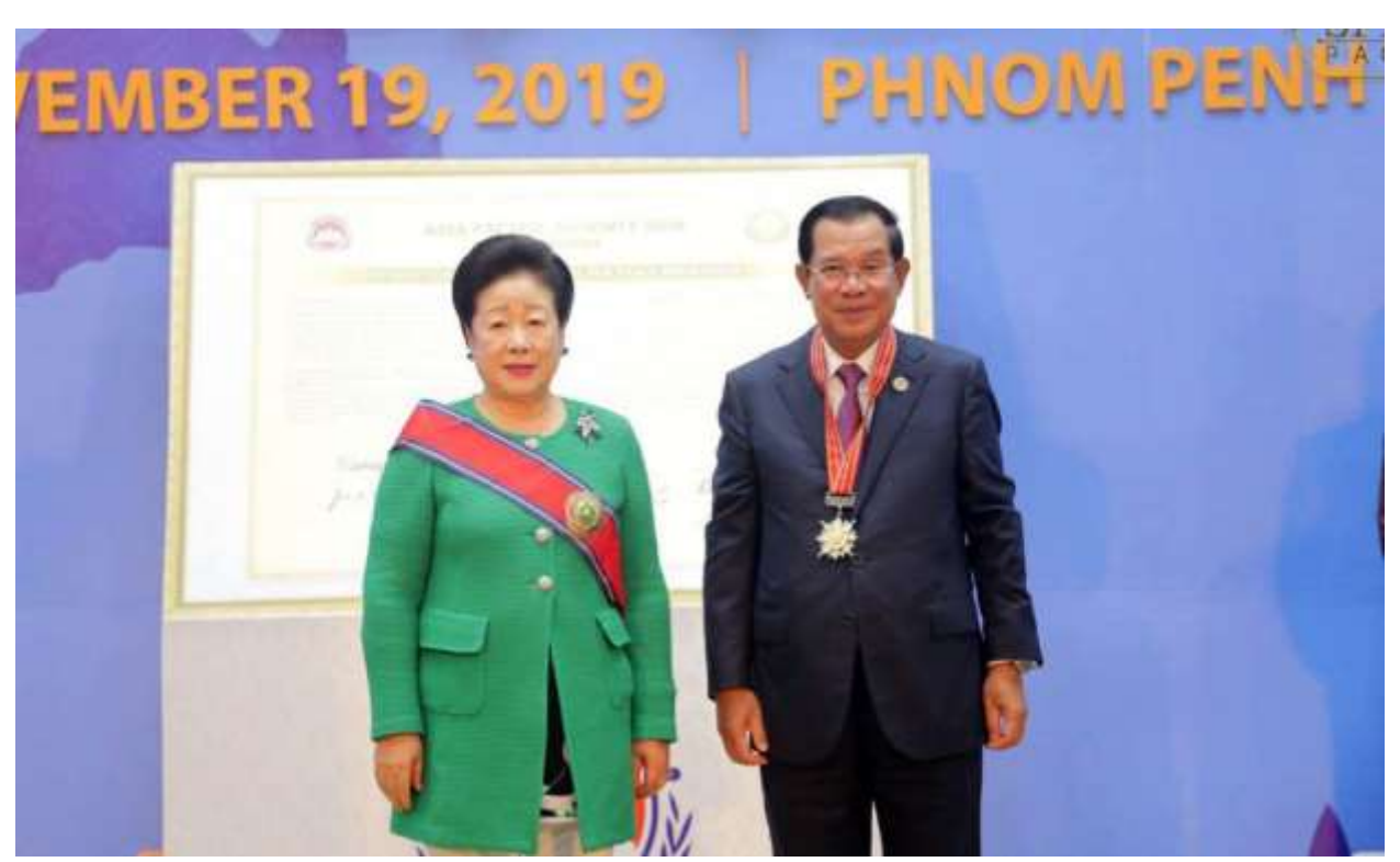
True Mother and Cambodian Prime Minister Hun Sen

Young Ho Yoon November 19, 2019 Letter to members