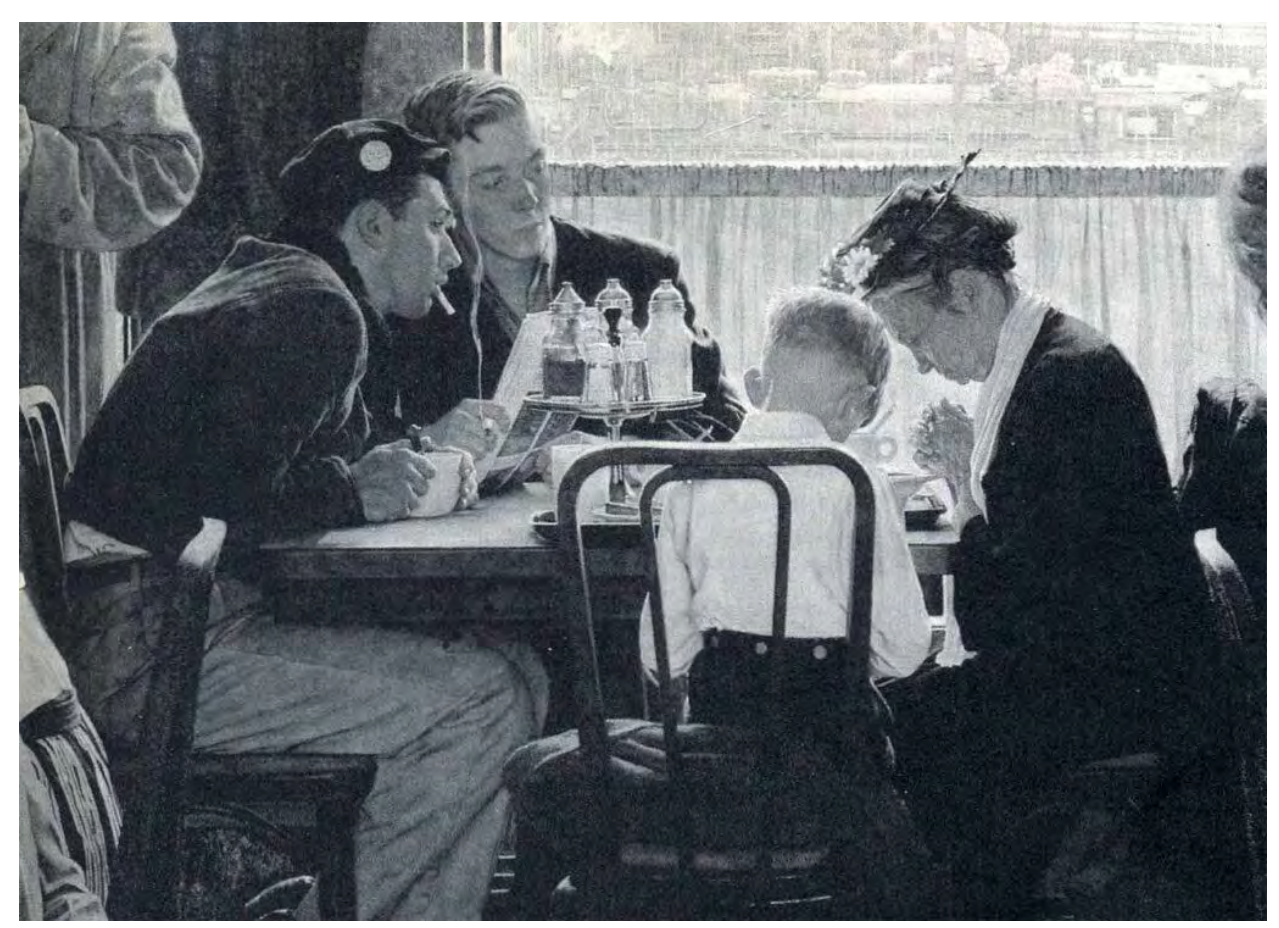
Children full of grandparents love usually don't become delinquents.

The smaller purpose must serve the bigger purpose. Why must the small live for the big? Because the small needs to be bigger. In order for the small to become bigger, the small need to serve the bigger. So all the time we need to talk, think, do, and pray for the church, for the country, and for the world. We should always think about our parents because our parents are bigger than us. Then our children will think of us more than themselves. Then, the later part of our life will be very happy. If we don't serve our parents, our children will not have that example and will not be inclined to serve us. Then when our old age comes, it will be very sorrowful.