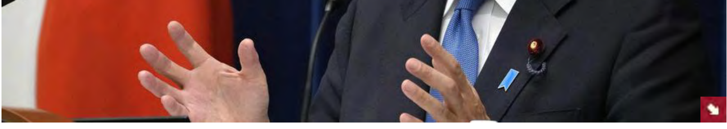
Japan's Prime Minister Fumio Kishida speaks during a news conference at the prime minister's official residence in Tokyo Wednesday, Aug. 31, 2022. Kishida has said his ruling party will cut ties with the Unification Church following a widening scandal trigged ... more >