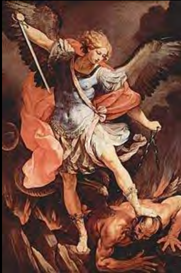
The Archangel Michael wears a late Roman military cloak and cuirass in this 17th century depiction by Guido Reni