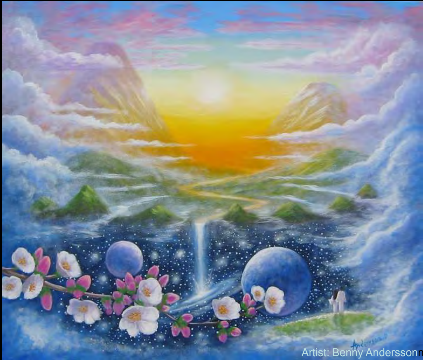
Artist: Benny Andersson