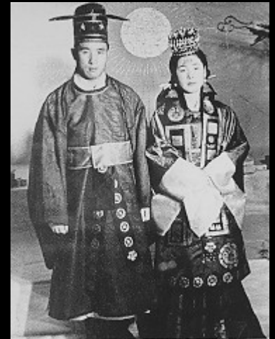
1960 Korea Marriage of the Lamb