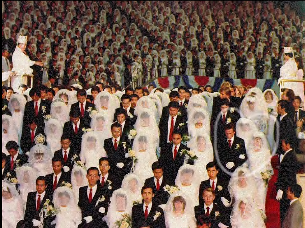
6000 Blessing Seoul Korea Oct 14 1982