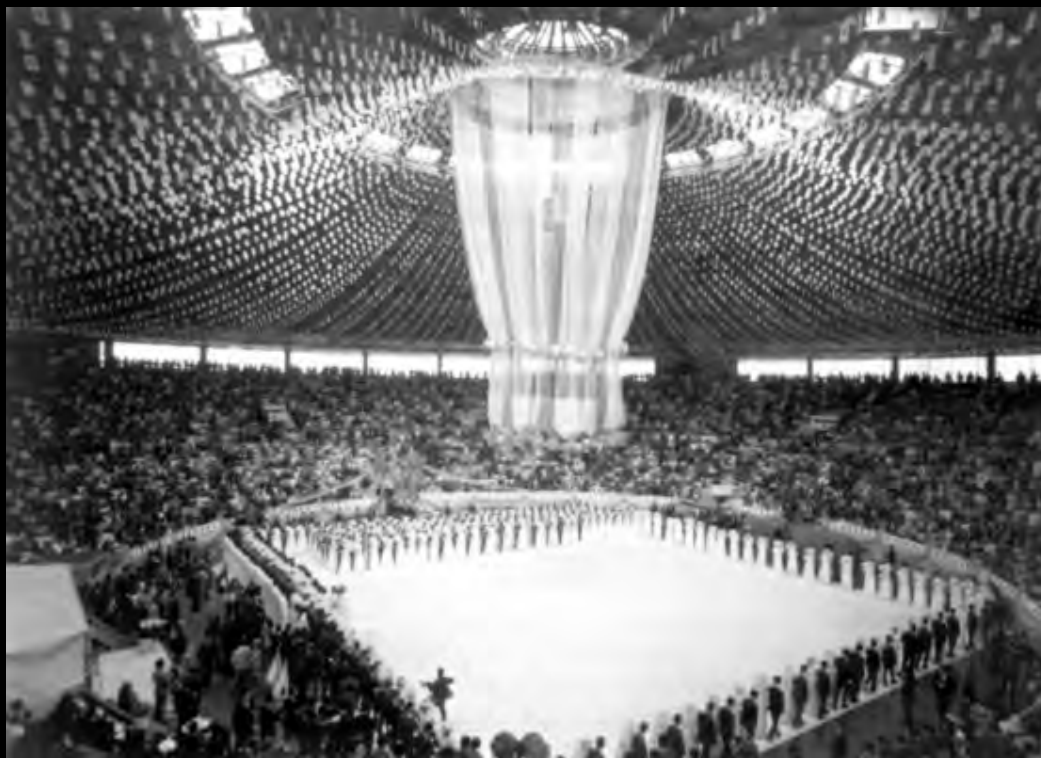
777 Blessing October 22, 1978