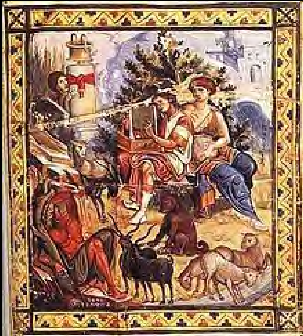
David playing his harp