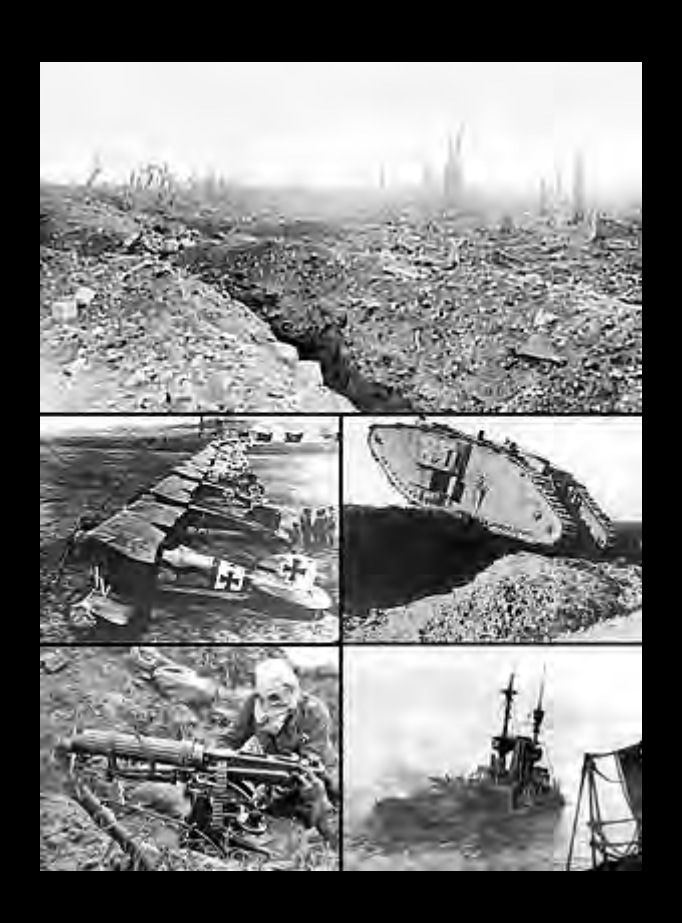
During 1st WW