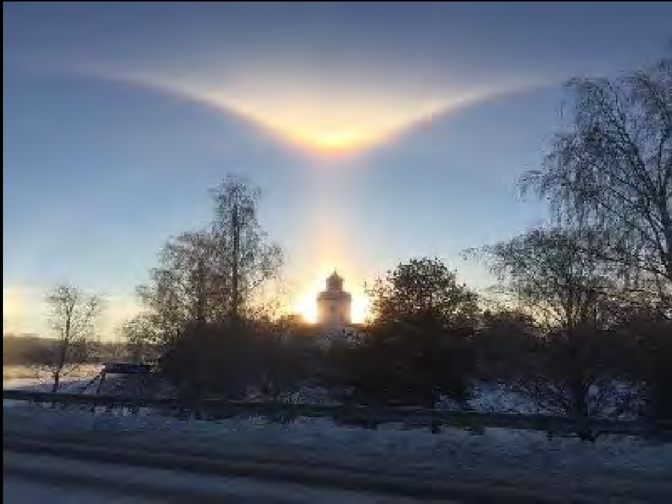
Sweden Halo - 2018