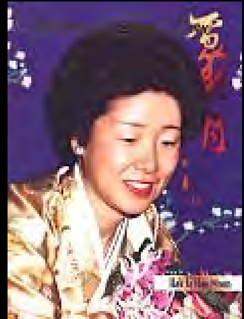
Hak Ja Han Moon