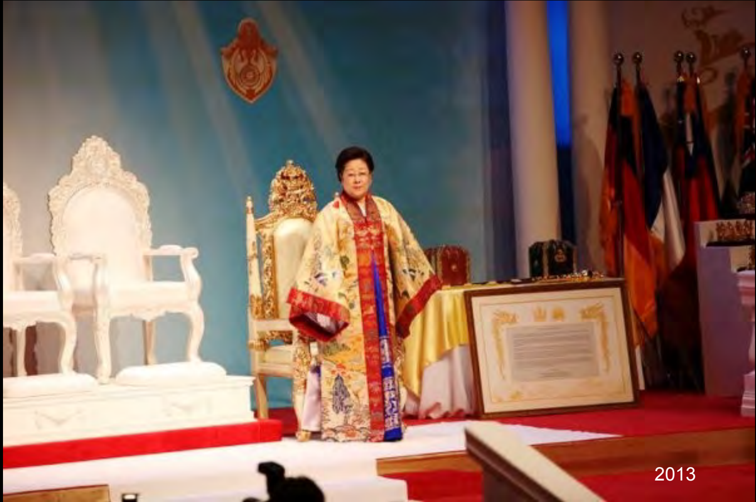
True Mother of Holy Mankind