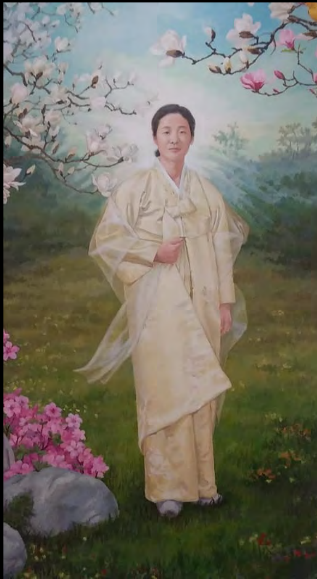
Hak Ja Han Moon