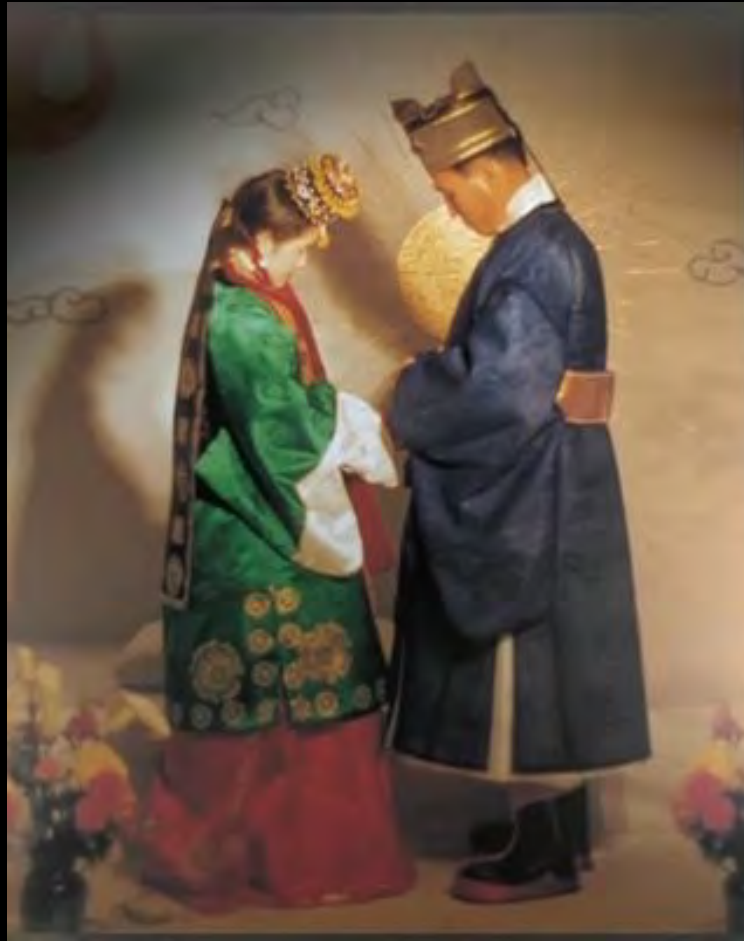
1960 start Korea