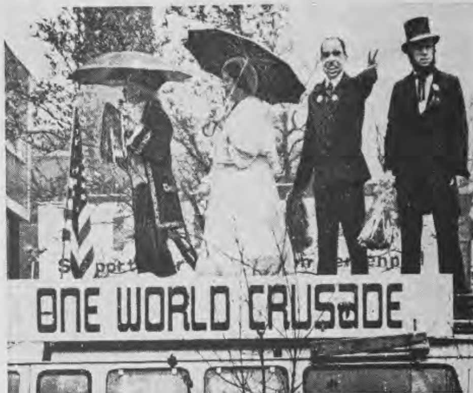
Braving the rain, members of the One World Crusade paraded Wednesday in Birmingham showing a patriotic

"If we strongly pray and support our President, we feel the country can pull together and the best way will become an-