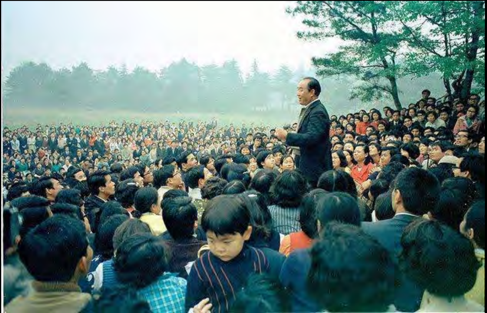
Holy people East