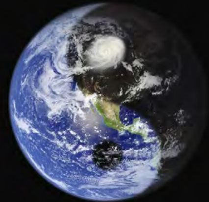
A United Physical/Spiritual World!