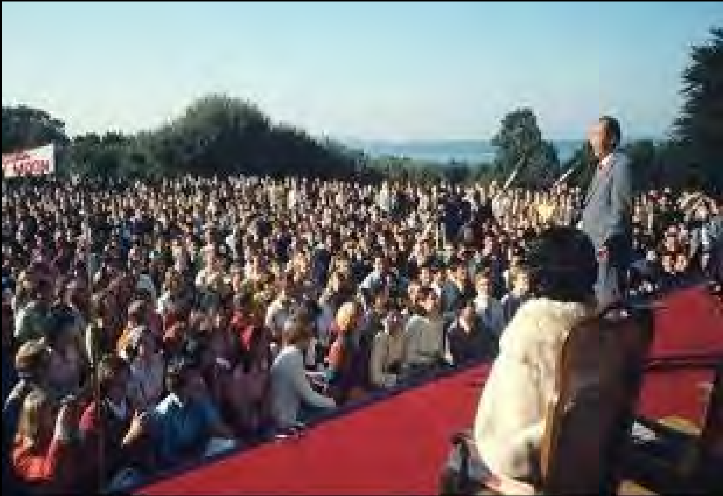
Holy people West