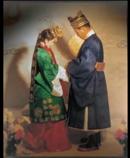
4 Holy Blessing Wows