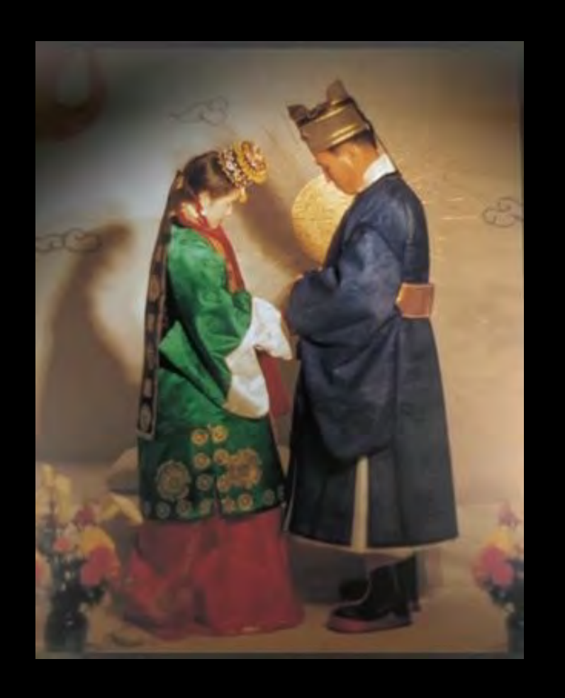
The Holy Biblical Marriage of the Lamb Hak Ja Han & Sun Myung Moon April 1960