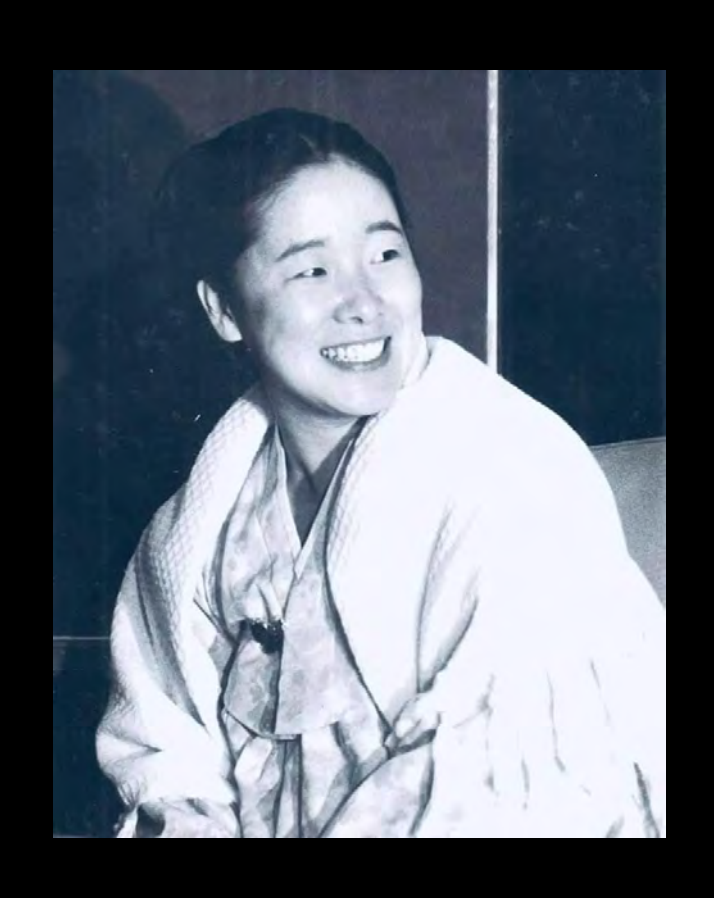
Hak Ja Han Moon True Mother of Heaven Earth and Humankind