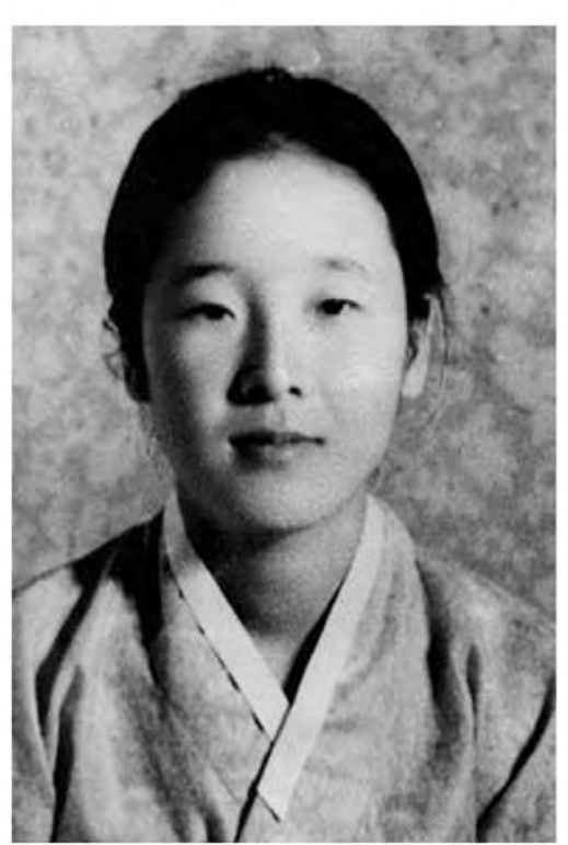
True Parents of Heaven Earth and Humankind