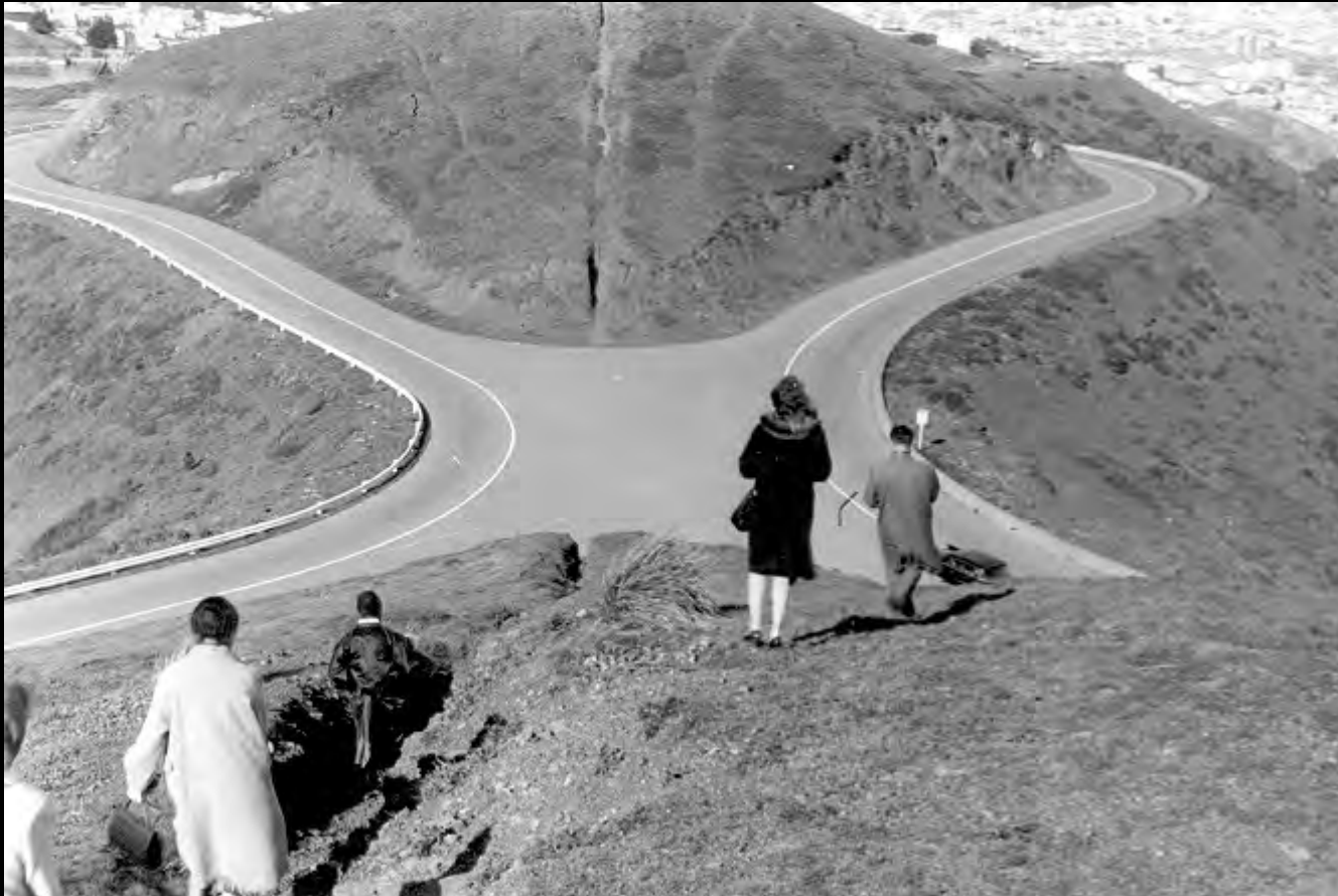
Holy Ground, Twin Peaks, San Francisco, CA, March 1965