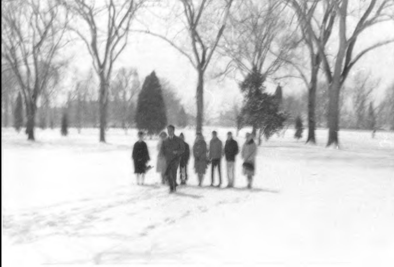
Holy Ground in City Park, Denver, CO, March 25, 1965.