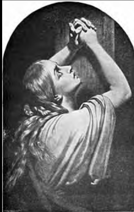
Mary Magdalene by Ary Scheffer (1795–1858).