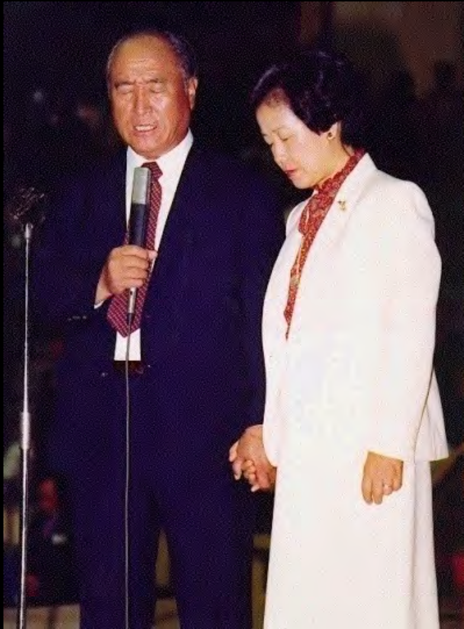
Common photo in the UC-prayer rooms world-wide.