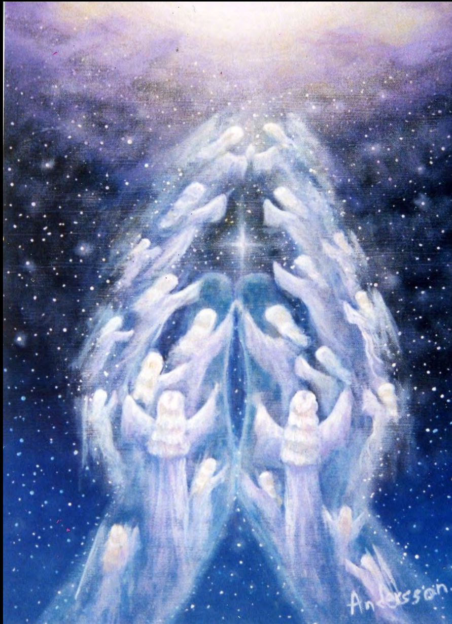
Artist: Benny Andersson