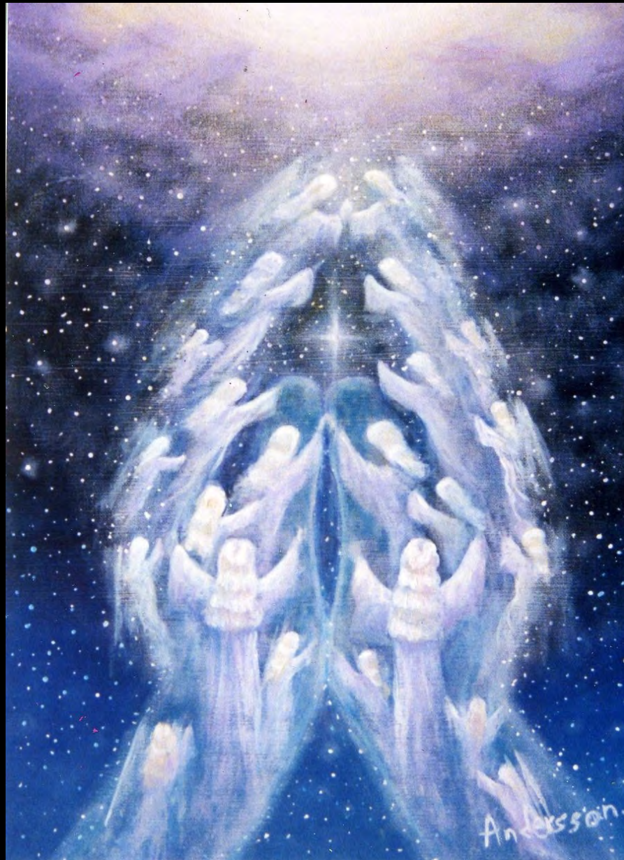
Artist: Benny Andersson