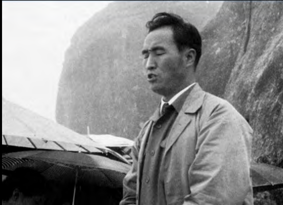
True Father praying in the 1960s