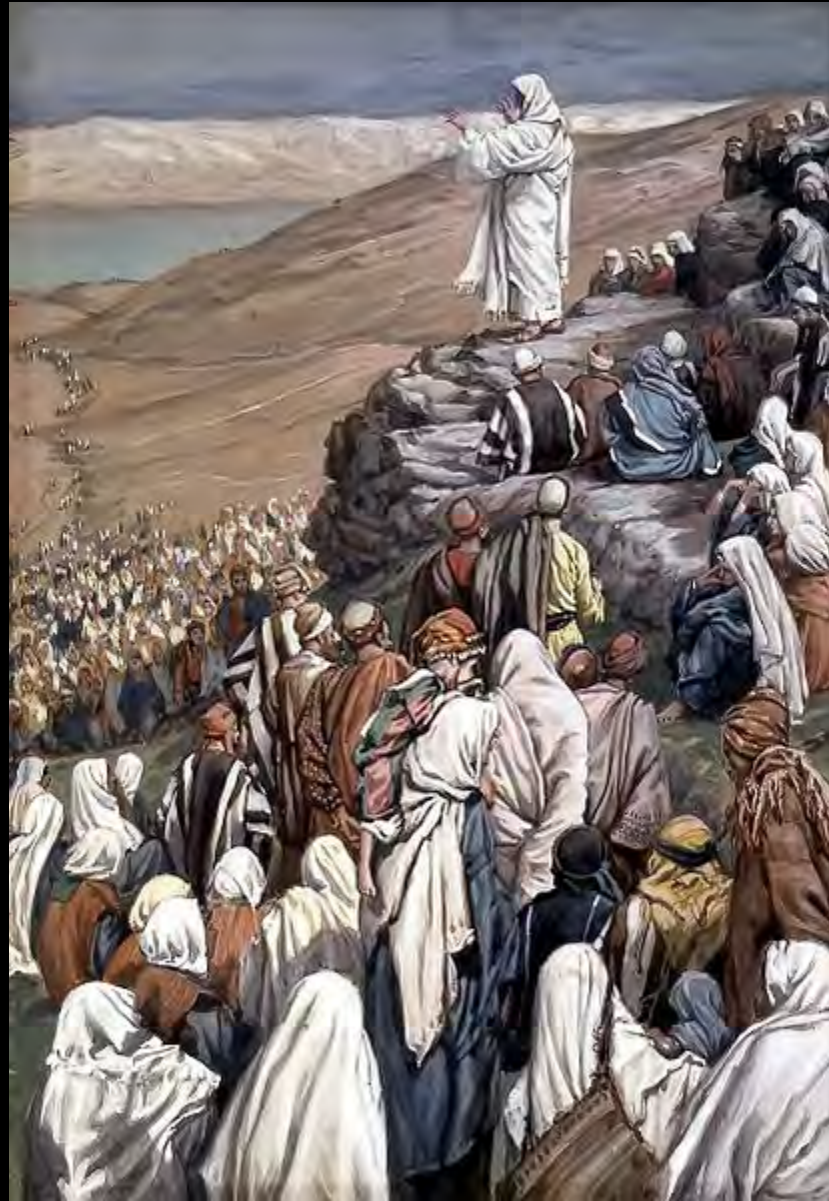
Sermon of the Mount