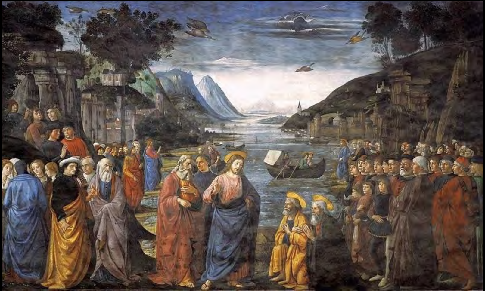
Jesus commissioning the Twelve Apostles. Painted 1481