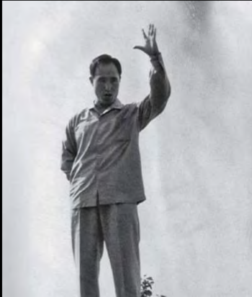
Early photo Sun Myung Moon – True Father