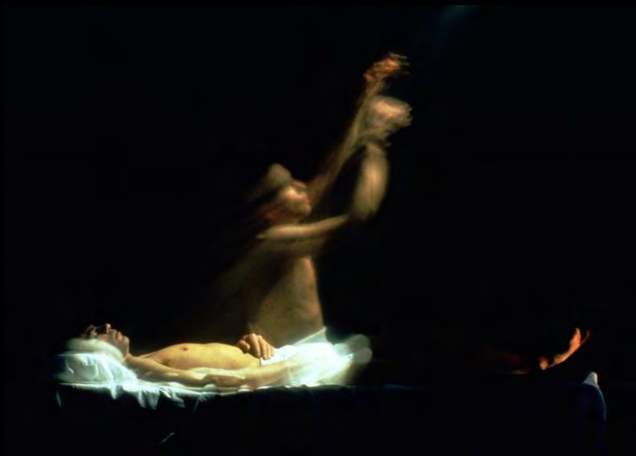
2 Bodies in One