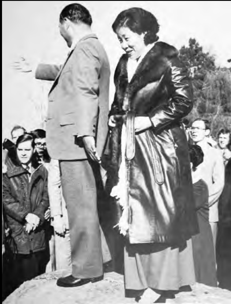
True Parents 1977