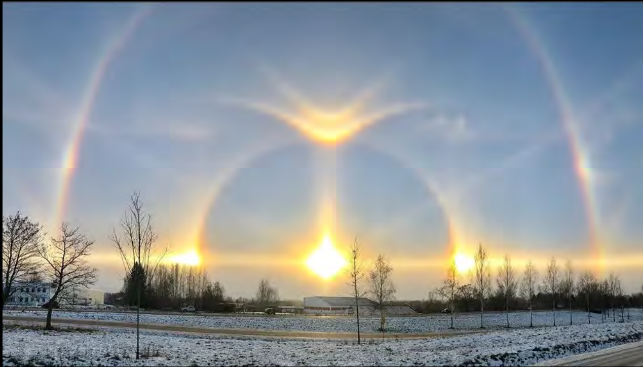
Halo Borlänge Sweden 2020