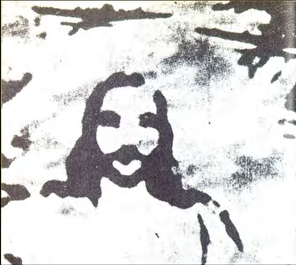
Clouds forming the face of Jesus over Korea 1950