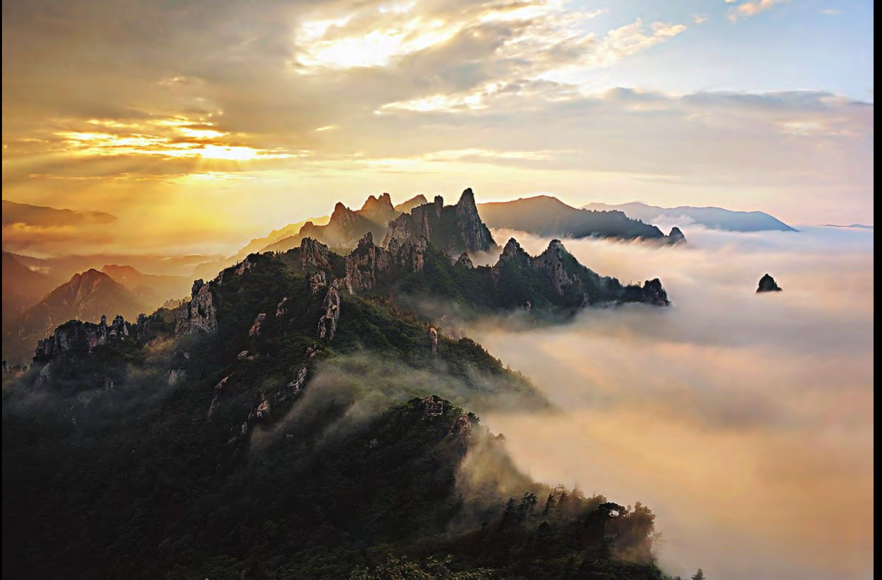
Korea – Holy Land of the Morning Calm