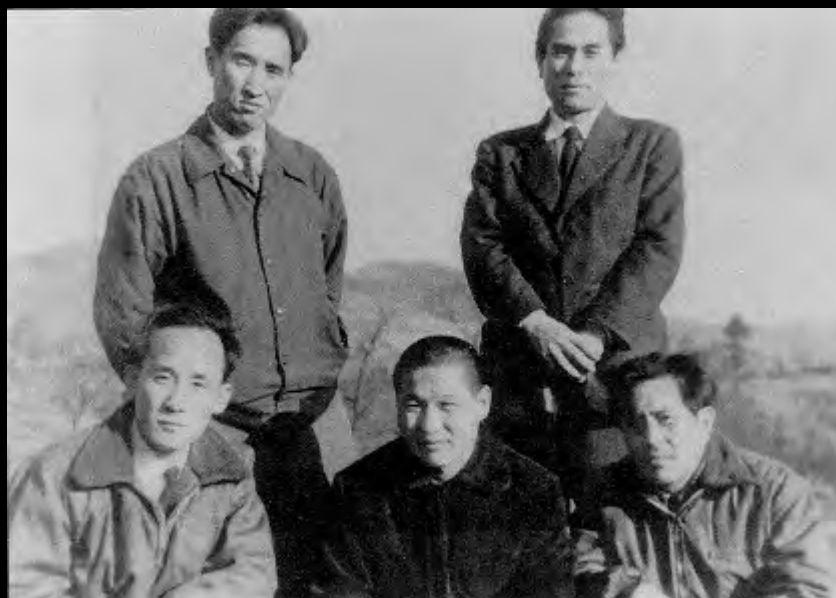
Official founding of HSA-UWC