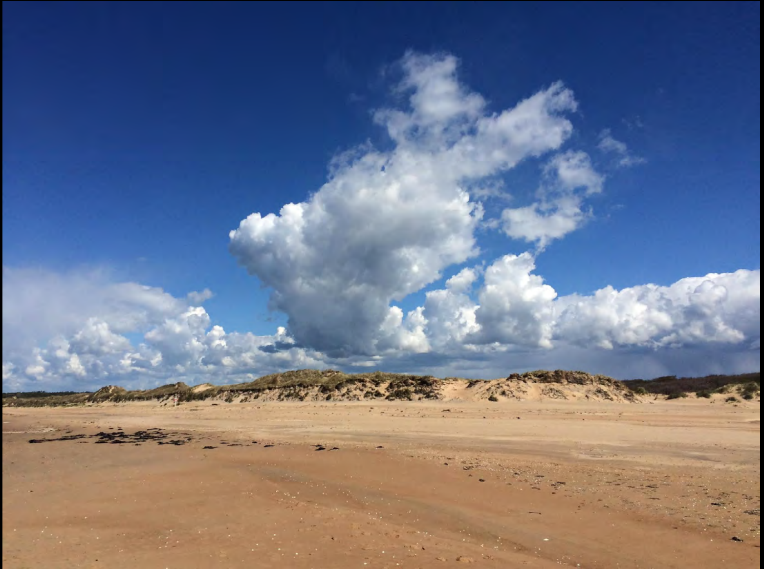
Haverdal Swedish west cast