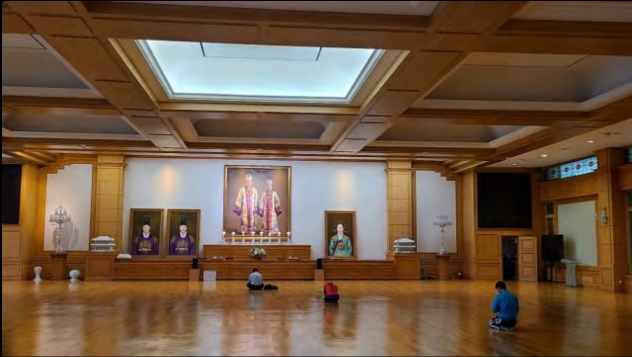
Cheonshim Won 2023