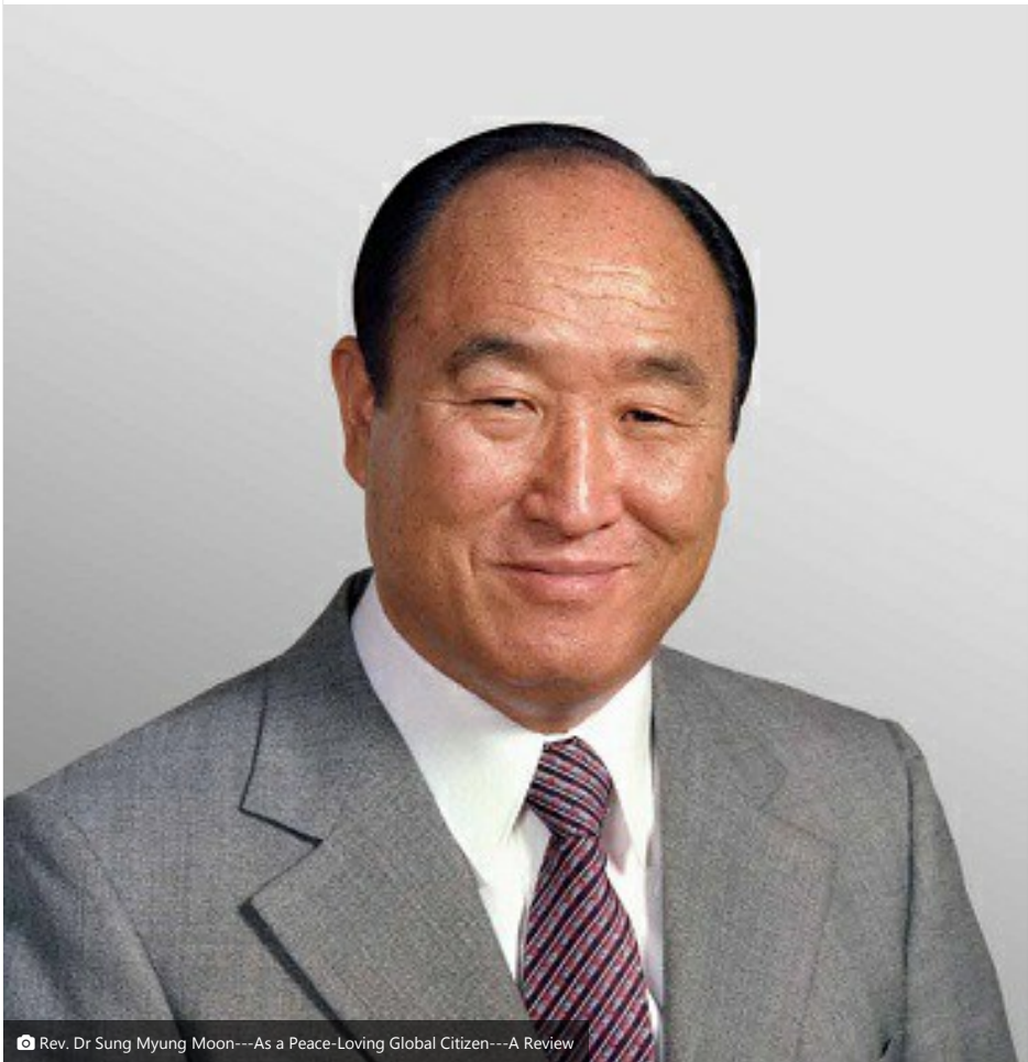
Rev. Dr Sung Myung Moon---As a Peace-Loving Global Citizen---A Review