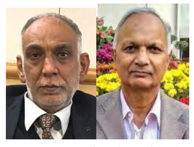
COVID -19 Era Education: Education warriors - Teachers-surmount