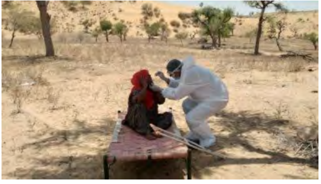
Virtual advice for pandemic hit Jodhpur aired from US from home grown experts