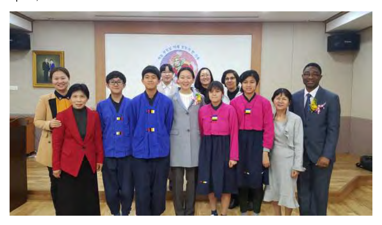
Learn Korean ~Experience the Unification tradition and lifestyle ~ Inherit the Culture of Heart ~ Take an Adventure!

Imagine a place where children explore and grow in their faith while also learning the language and culture of True Parents. The General Orientation Program (GOP) in Korea has provided an immersive cultural and spiritual experience for young people for over 30 years.