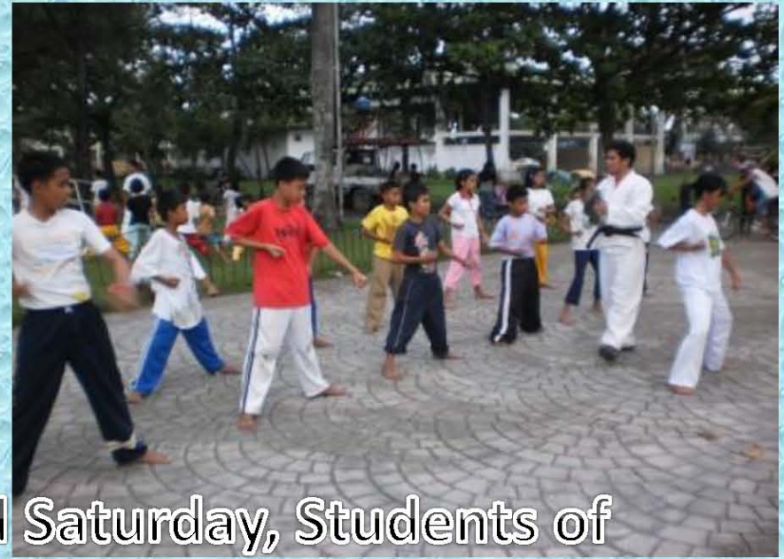
Every Monday and Saturday, Students of Taboc Suba join TIMD training