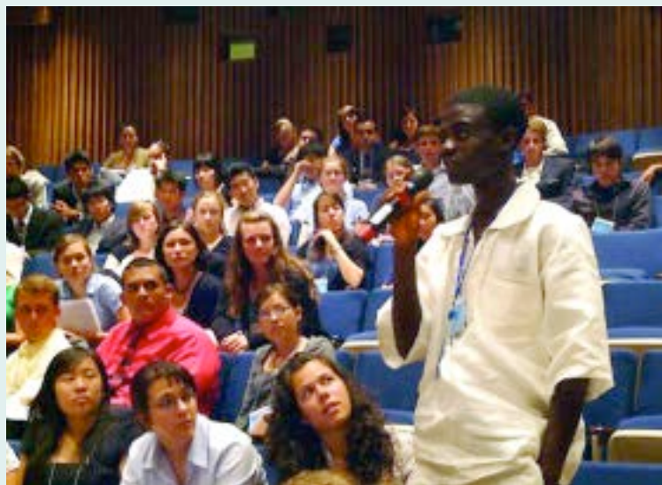
A question to the panel at the YFWP-sponsored Youth Forum at the United Nations in New York.

YFWP also organized two important youth forums at the United Nations Headquarters in New York. These forums addressed strategic responses to the problems of underdevelopment and the importance of an ethic of service and interreligious cooperation to create a culture of peace. ■