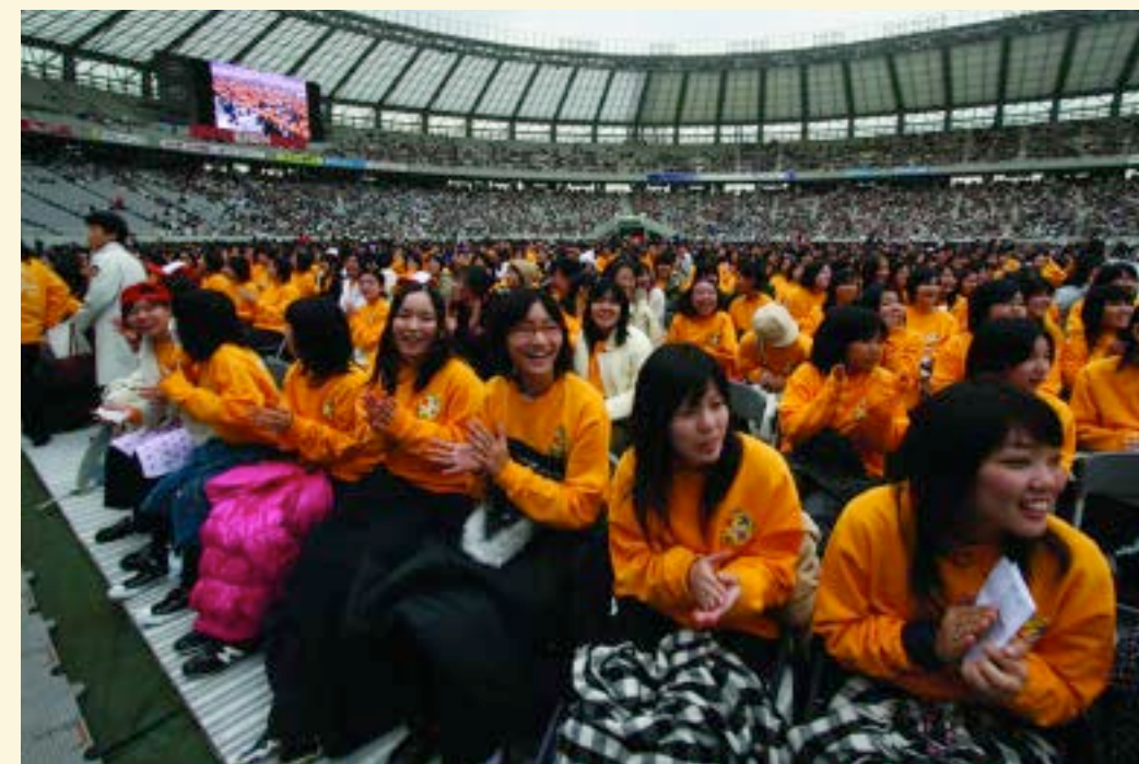
The Global Peace Festival in Japan drew thousands to the main event in Tokyo.

pants from government, business, the volunteer sector, and communities of faith, the GPF is bringing the vision of One Family under God to influential young men and women who will take the lead in shaping the global society in the twenty-first century. YFWP played a lead role in organizing and supporting festivals in Paraguay, Kenya, the