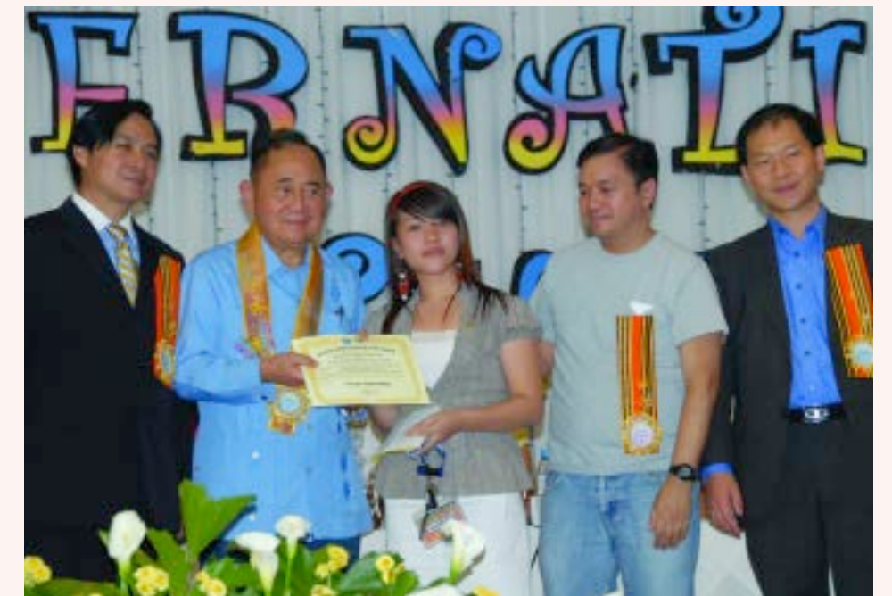
Former Philippine Speaker of the House Jose DeVenecia recognizes a Young Ambassador for Peace at the Global Peace Festival in Mindanao.

Young Ambassadors for Peace are collaborating with international peace builders in service and relief projects, character education programs, and sponsorship of dialog in conflict areas.