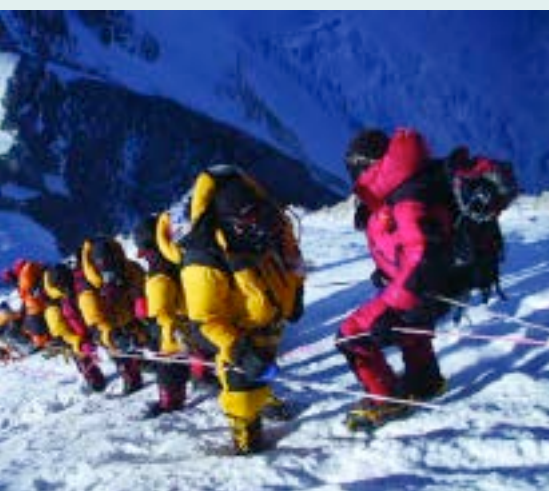
Members of the First Philippine Women Everest Expedition received YFWP sponsorship and were later named Young Ambassadors for Peace.

YFWP-Nepal's work included a comprehensive Young Ambassador For Peace initiative, with appointments