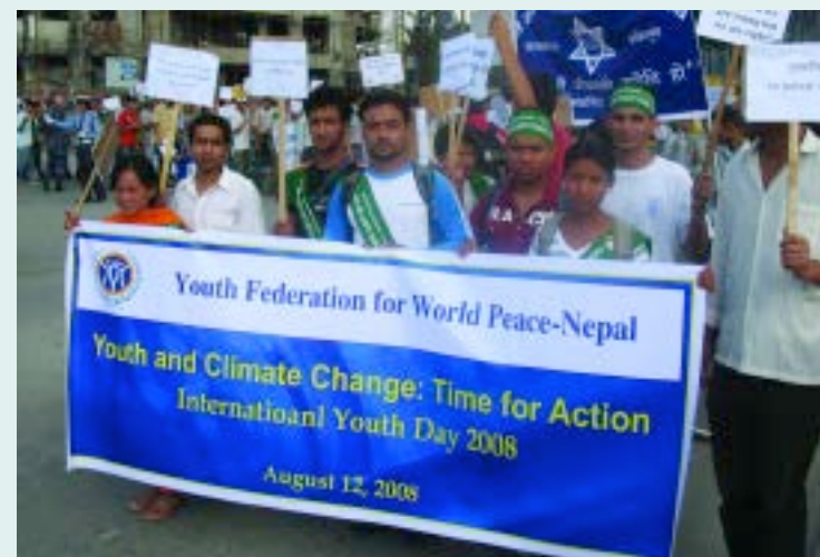
Young leaders call for action at a YFWP rally on climate change in Nepal's capital of Kathmandu.

Underscoring the growing effectiveness of YFWP's strategic partnerships, fifteen youth organizations joined in rally, which was followed by a Young Ambassador for Peace Award Ceremony and Education Program.