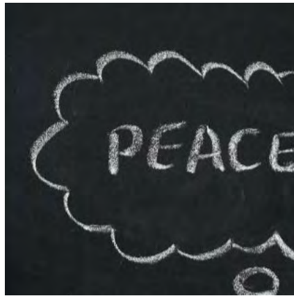
Can We Make Peace A Reality? WFWP Canada hosts Cornerstone for Peace Webinar