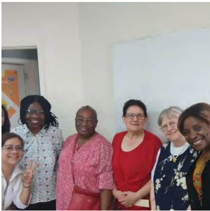
The School of Love: Cornerstone for Peace