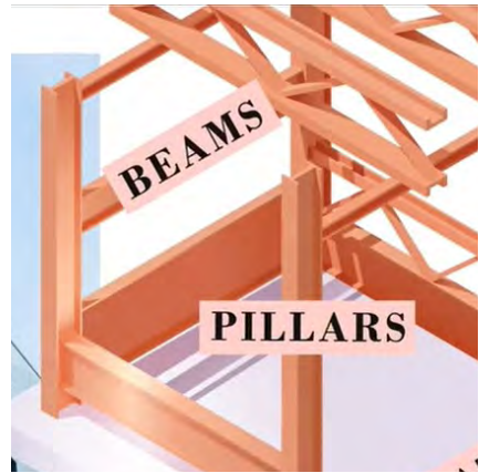
Making a Conscious Shift for Peace: Cornerstone for Peace Seminar