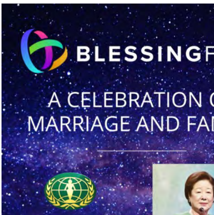
WFWP Watch Party: Blessing Fest