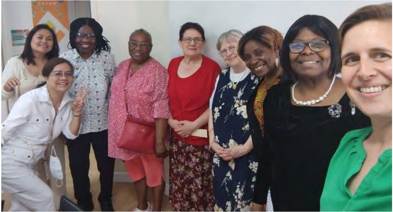
Presenter and participants pose for a selfie.

"The family is the school where love for humanity is taught and learned. When children who are raised in the warm love of their parents go out into the world, they will care for people in difficulty in the manner they learned in their home. People raised in loving relationships with their own brothers and sisters will go into society and share their caring hearts with their neighbors." - Rev. Sun Myung Moon