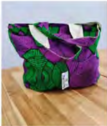
Purple and Green Large African Print Bag $25.00