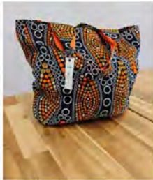
Black and Orange Large African Print Bag $25.00