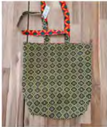
Large Reversible African Print Tote $25.00