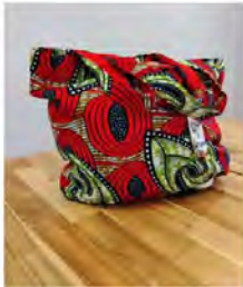
Red and Green Large African Print Bag $25.00