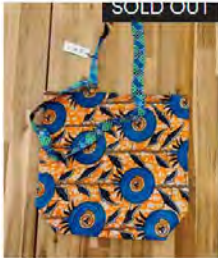
Large Reversible African Print Tote $25.00