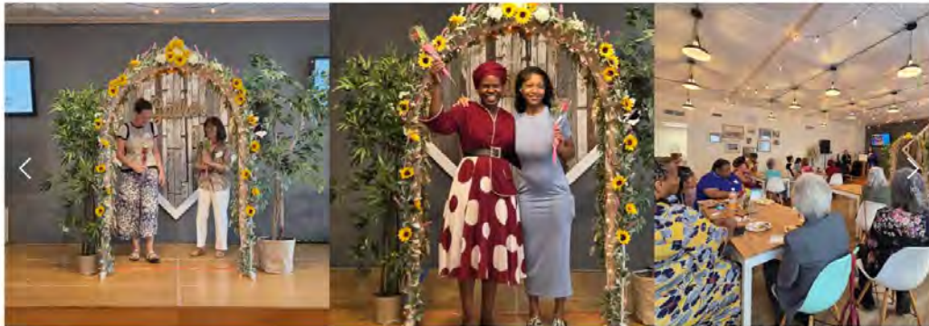
International Day of Peace • Bridge of Peace

The Bridge of Peace event successfully achieved its purpose: fostering harmony, celebrating connection, and leaving a lasting impression on everyone in attendance.