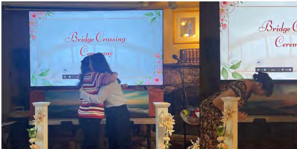
International Day of Peace - Bridge of Peace

Overall, the highlight of the day was the unique atmosphere of warmth and joy . The entire congregation participated wholeheartedly, creating a space filled with love, laughter, and a sense of belonging.