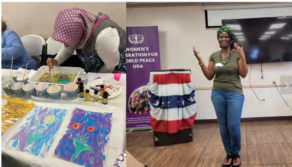
WFP New Jersey • International Day of Peace

With about 50 people in attendance—young and old, families and individuals—the room was filled with laughter, learning, and a spirit of peace. More than just a cultural fair, Passport to Peace was a living reminder that when we open ourselves to one another, we can build bridges across divides and move closer to the dream of one global family.