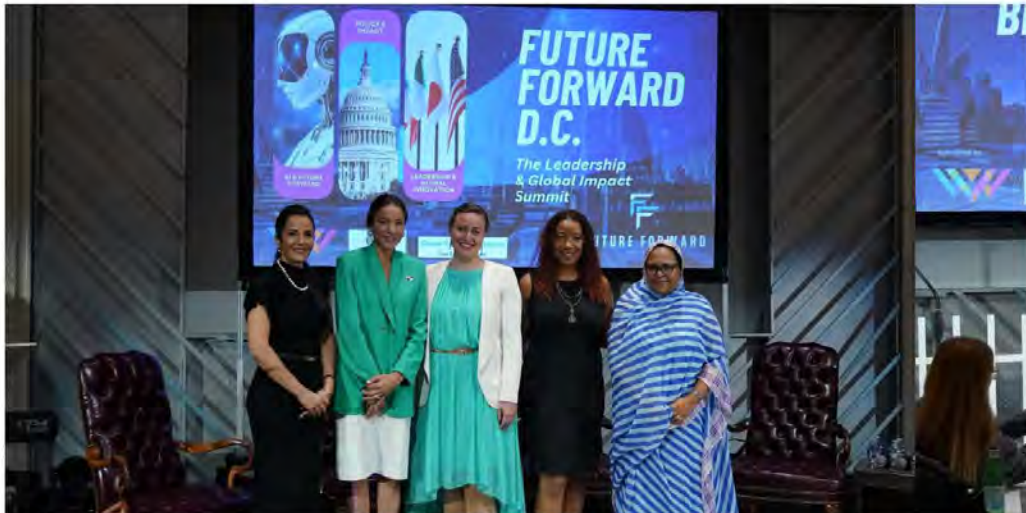
Bridge of Peace

The partnership between Wonder Women Tech and WFWP underscored the summit's unique strength: bridging innovation with peacebuilding, technology with humanity, and leadership with reconciliation. Together, the two organizations created a platform where bold ideas and bold relationships converged, demonstrating that the future must be built not only on technological advancement but also on trust, unity, and shared responsibility.