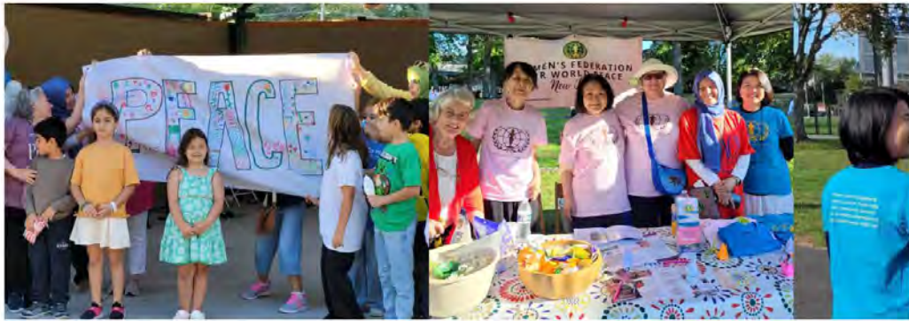
WFP New Jersey • International Day of Peace

Overall, the festival provided an exciting and vibrant experience for the WFP team. While additional giveaways and pamphlets would have enhanced outreach, the organization is grateful for the opportunity to showcase its mission and engage with the broader community.