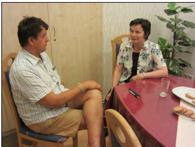
Discussions after the meeting

The guests enjoyed the discussion and actively took part in it.