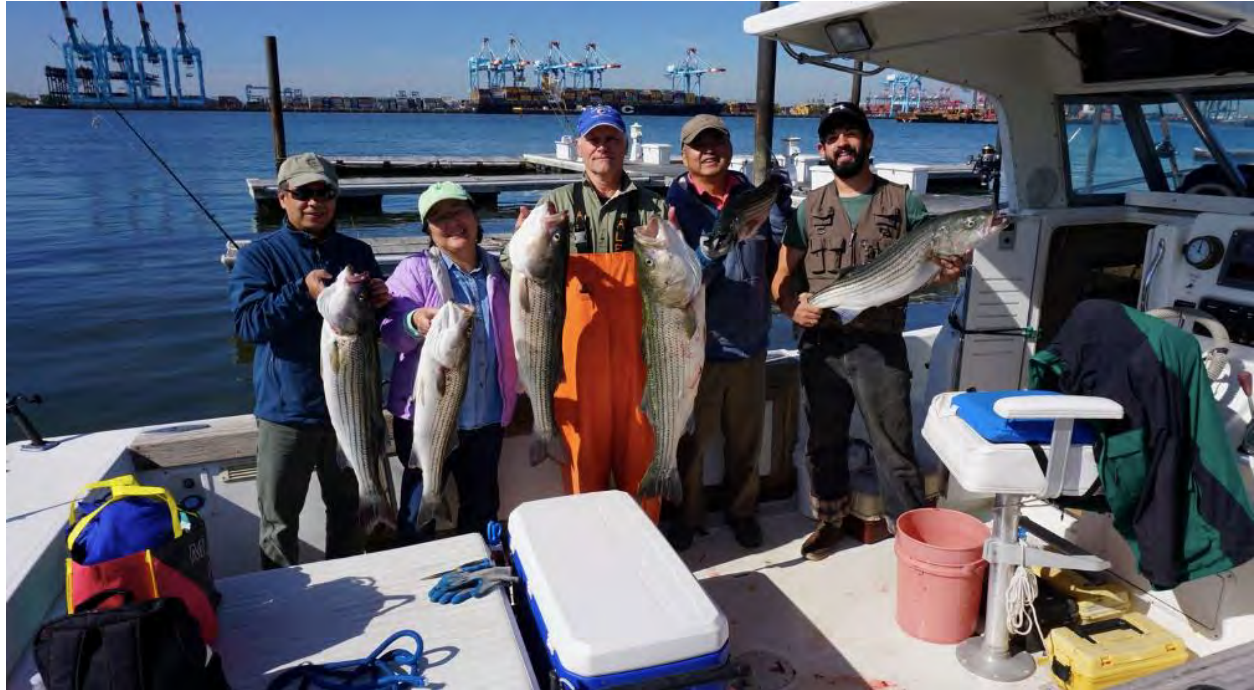
Ocean Church crew catch fish in the New York Bay and East River (FFWPU USA, November 2016)