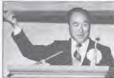
Founder of the International Cultural Foundation Reverend Sun Myung Moon

Today, all humanity is yearning to free itself from hunger, disease and war, and hoping for the ideal world overflowing with peace and happiness. We simply cannot look upon this cherished desire of humanity as though it were a dream which can never be realized.