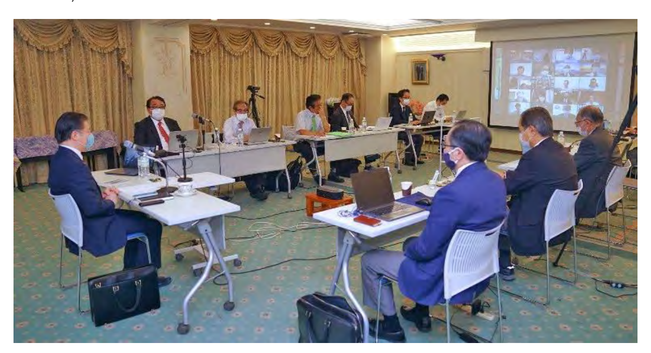
Tokyo, Japan -- The Inaugural Ceremony of the Peace Road 2021 in Japan, held on June 25 in Shinjuku Ward, Tokyo and virtually as a webinar, was the second and final session of the ILC2021 -- Japan in June 2021. Approximately 100 cyclists and executive members of the initiative participated in the event. For this year's Peace Road, young people will cycle across the country again in support of promoting friendship between Japan and South Korea, the peaceful unification of the Korean Peninsula and world peace.