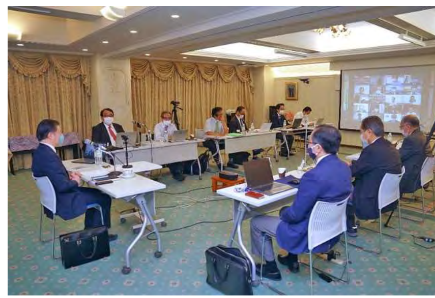
All rights reserved

Written by UPF-Japan Tuesday, June 22, 2021