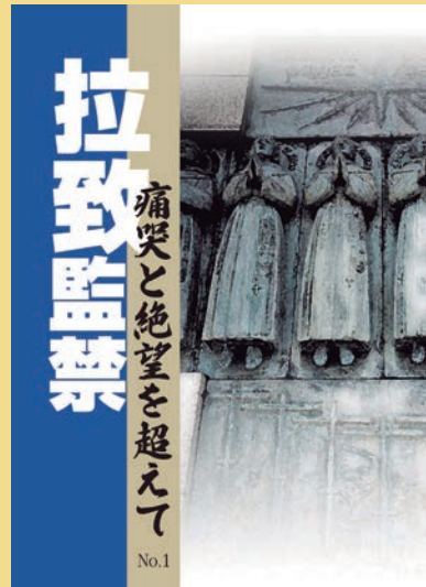
Abduction and Confinement: Beyond Despair and Hopelessness