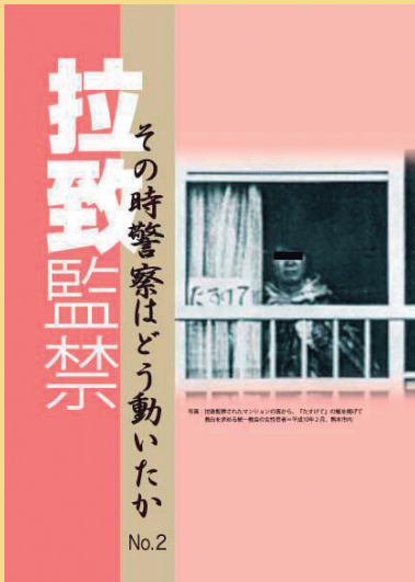
Abduction and Confinement: What Were the Police Doing about It?