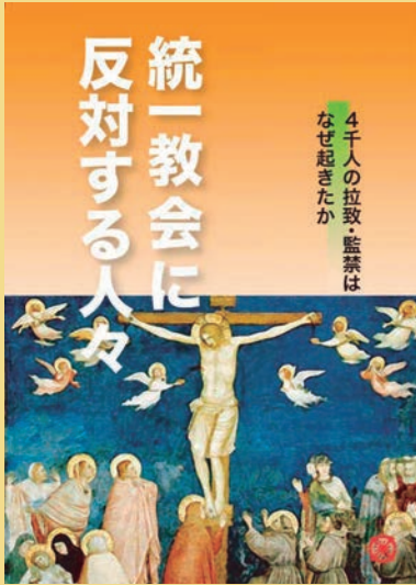
Those Who Oppose the Unification Church