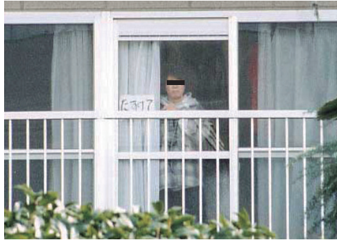
A young woman confined against her will; the note beside her reads, "Help me!"

However, religious persecution against Unification Church members has continued to this day, to a degree reminiscent of the cruel oppression of Christians in medieval Japan!