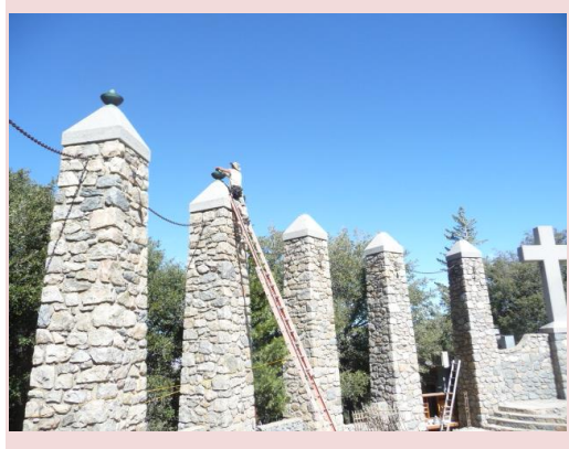
Gene taking off the fixtures

on E-bay. Unfortunately, the seller said it was a one of a kind found in an attic back East and had no idea where it was made. Most other lampshades available are not over 10" high so there is not a ready available lampshade out there. So here is the real challenge; Who is the manufacturer of this glass lampshade and do they still have the dies to make more lamps? Or, is there someone out there that can make or replicate these lampshades ... can you solve this mystery?