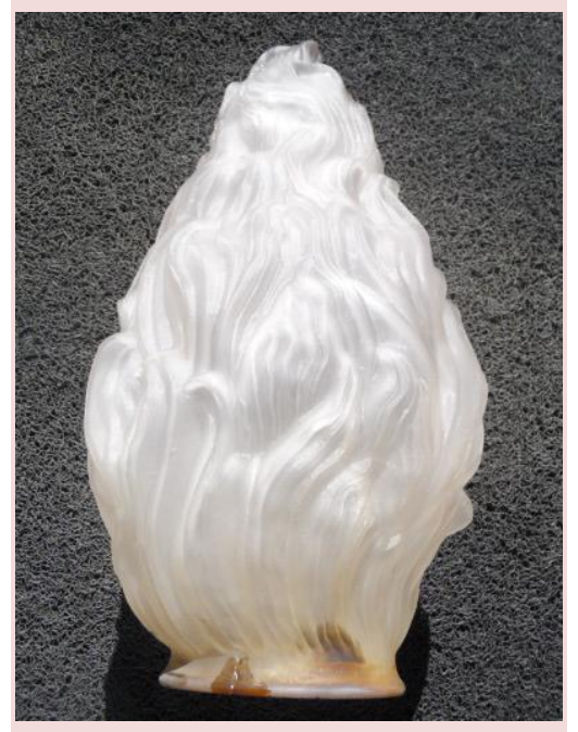
Lamp Side View

acid washed and then painted with a gold power coat that will make them look great for years! The glass Lampshades are a different story. They are the largest lampshades around measuring 17" tall about 9" across the widest part and with a 5" fitter (collar). The pattern on the glass is simply beautiful as shown below.