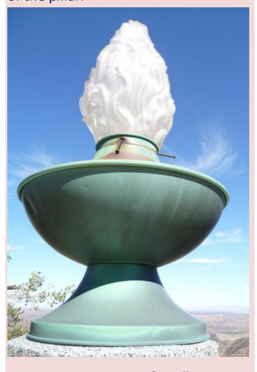
Lamp on top of a pillar

The lamps at the Pillars of God are very unique lighting fixtures. Recently, Gene Barnhurst and I tackled getting these off the tops of the pillars! There are 12 pillars, 10 of which still had fixtures on them and of the 10 only 2 still had the glass lampshades on them (with bullet holes). This is where the story gets interesting. These lamps can be found by a variety of names; Torch Lamps, Empire Torch Lamps, Torchiere lamps, Statue of Liberty Lamps, Flame shaped glass globe and even more. The picture of the glass lampshade and fixture below was taken while the fixture was still on top of the pillar.