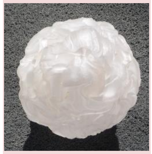
Lamp Top View

Here is a top view of the lamp and again you can see the amazing pattern formed into the glass!