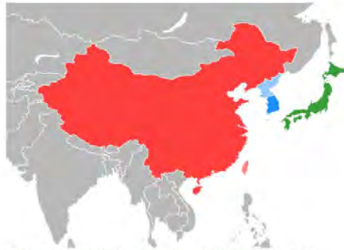
China, North Korea, South Korea, Japan.

In 2012, Moon was posthumously awarded North Korea's National Reunification prize. On the 1st anniversary of Reverend Moon's death, North Korean chairman Kim Jong-un expressed condolences to his family, saying Kim Jong-un prayed for the repose of Moon, who worked hard for national concord, prosperity and reunification and world peace. Last August, Kim Jong-un again sent condolences via the North Korean Peace Advisory Committee. On the 10th anniversary of Moon's passing, Kim again provided condolences and respect to Madame Han.