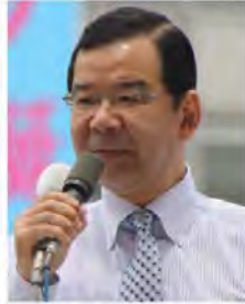
Kazuo Shii.

Speaker Newt Gingrich has pointed out in a Washington Times op-ed that the chairman of the Japanese Communist Party has revealed their plan in an interview. Communist Party chairman Shii said openly that the starting point in the history of this, was an anti-communist organization that was united with the Unification Church . They called this half a century of historical collusion between the two organizations.