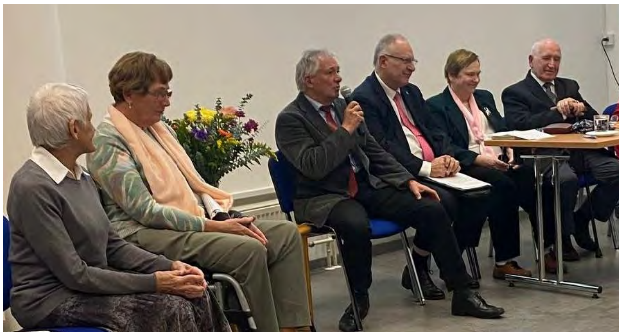
Featured image above: Some of the members on the panel in Bratislava 13th November 2023