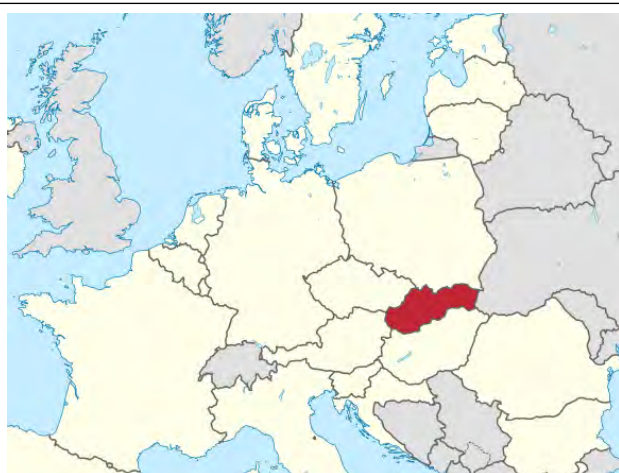
Slovakia (in red)