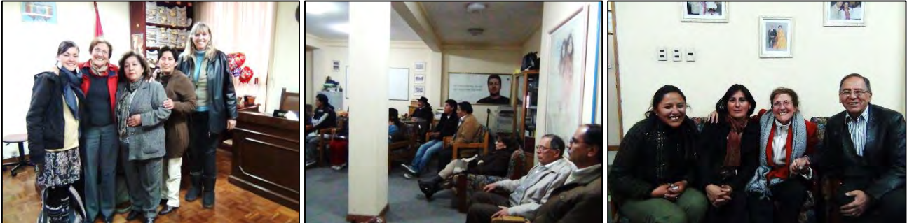
Visiting an Ambassador for Peace woman judge. - Having an event at a member's house - Meeting and sharing