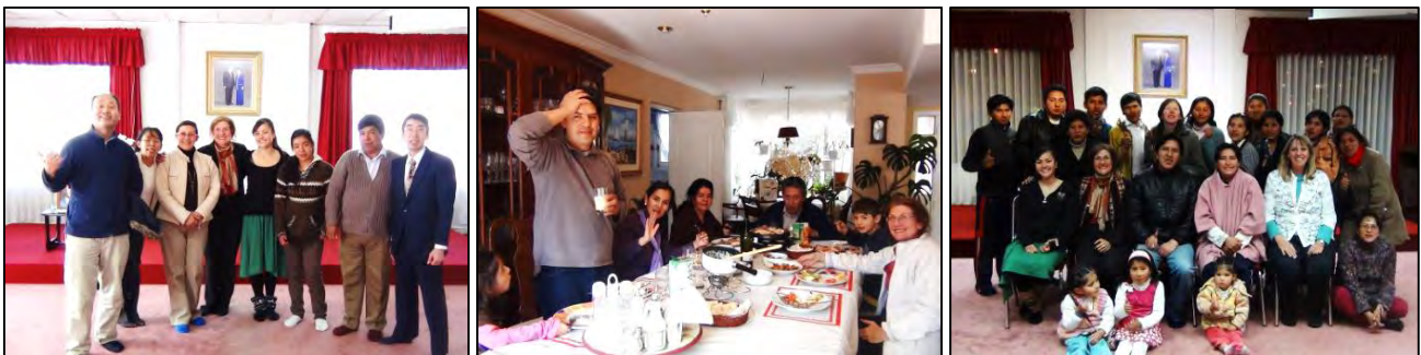
After a Sunday Service, with leadership from Cochabamba and Santa Cruz - With the son's family - After the last goodbye dinner at the Federation center

The inaugural event of the WFWP in Bolivia took place during our stay, so we could jump in for a dance and Principle presentation. A few participants of a previous event at a member's house came. One of them, a member of "Centro Shalom", organized an event around the Universal Principles, one more opportunity to give out beauty, goodness and truth. At the 2 Sunday services, I was able to share about the mission of the Japanese missionaries. A few of the people who had joined in 1996-7 were present. We felt so much gratitude. I could see that the year spent there by the 120 had not been in vain and had indeed brought some substantial fruit for the Providence.