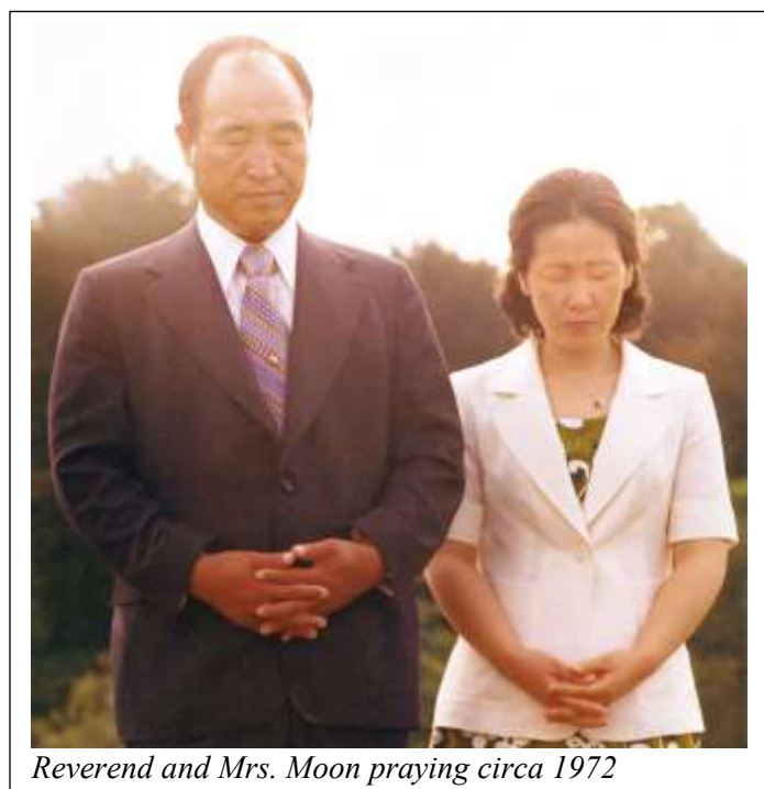
Reverend and Mrs. Moon praying circa 1972

“The teacher with whom we have the closest relationship is our heart. Our heart is more precious to us than our closest friends and even more precious than our parents... For a person to polish his heart to the point that it becomes as clear as crystal, he absolutely must spend time in direct conversation with his heart in an environment where he is away from the world and alone with his heart. It will be a time of intense loneliness, but the moment we become close to our hearts is the time of prayer and meditation. It is a time when we can take ownership over our hearts. When we isolate ourselves from the noise around us and allow our thoughts to settle, we can see into the deepest parts of our hearts...” (pp. 231-32).