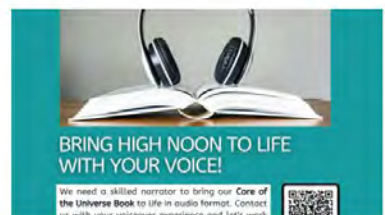
Looking for a Narrator for High Noon's Audiobook