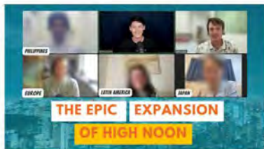
#195- The Epic Expansion of High Noon