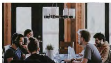
We're Hiring! Job Opening for Korean Chapter Leader