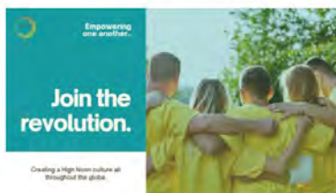
Join the Revolution Towards a More Empowering Future